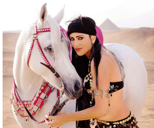
Photo taken in Egypt